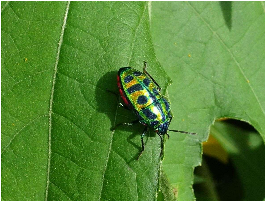
Calidea dregii (Scutelleridae, Scutellerinae, Scutellerini)