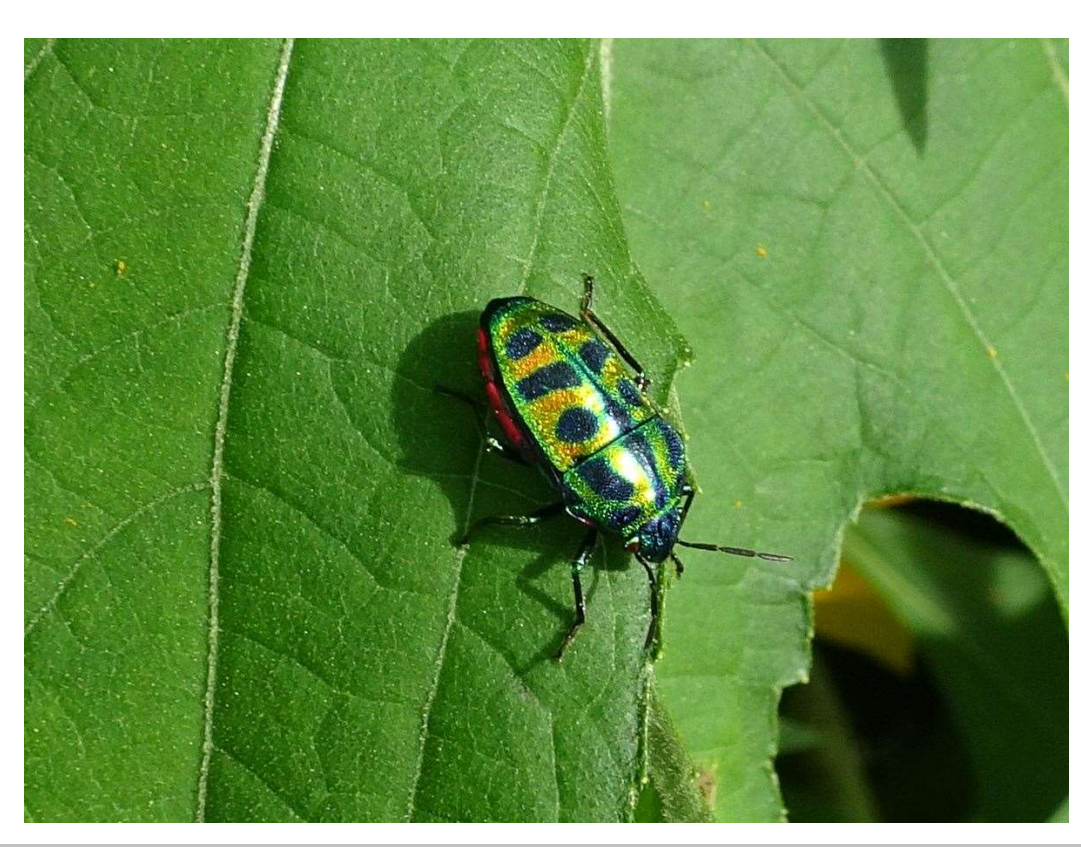
Calidea dregii (Scutelleridae, Scutellerinae, Scutellerini)

\underline{\text{https://itcer.org}} \rightarrow \textbf{Events}